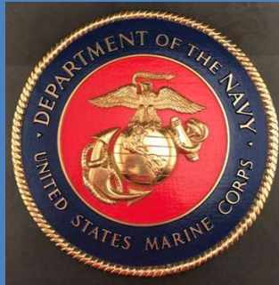
Department of Navy | U.S. Marine Corps Ref #6159FC | 15" Butyrate Full Color Seal