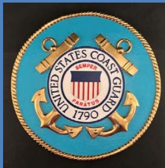
U.S. Coast Guard Ref #6001FC | 15" Butyrate Full Color Seal