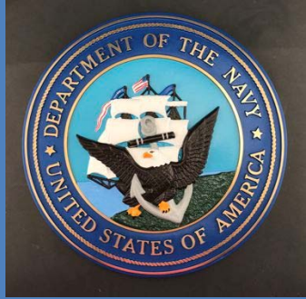
Department of the Navy Ref #6090FC | 15" Butyrate Full Color Seal