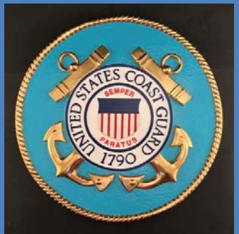
U.S. Coast Guard Ref #6001FC | 15" Butyrate Full Color Seal