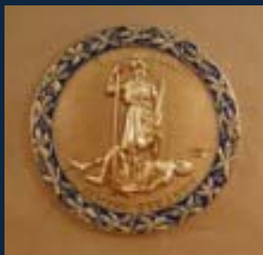
Dark Blue | PMS 280