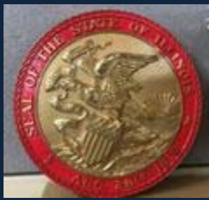
Red | PMS 200